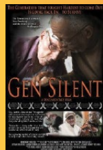
GEN SILENT October 4