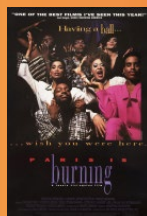
PARIS IS BURNING October 25