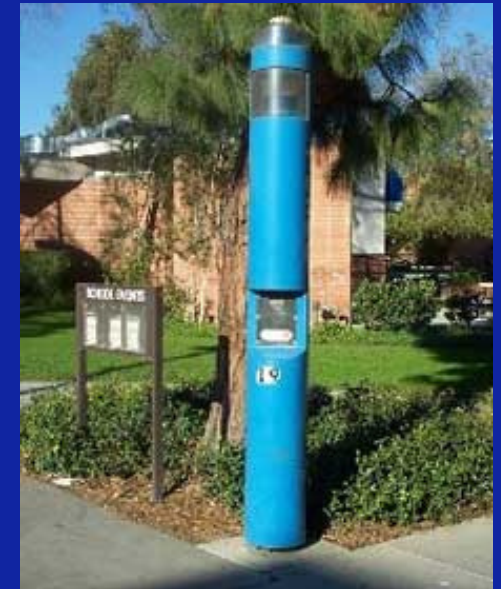
"CODE BLUE" EMERGENCY PHONE