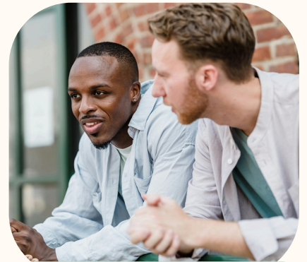
MEN'S THERAPY GROUP