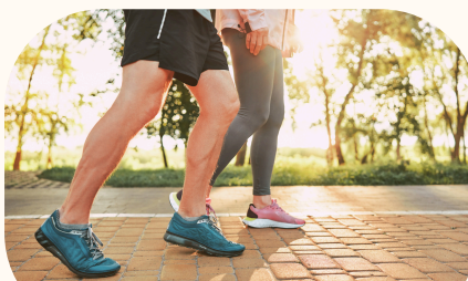
MENTAL HEALTH MORNING WALKS