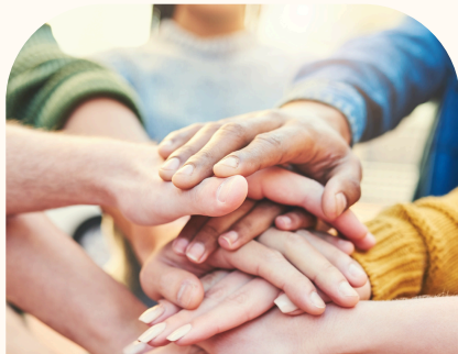
IN THIS TOGETHER: COMMUNITY TALKS