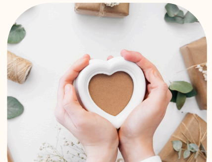
CENTER FOR WELL- BEING ACTIVITIES