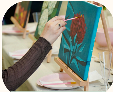
ART & NATURE THERAPY GROUP