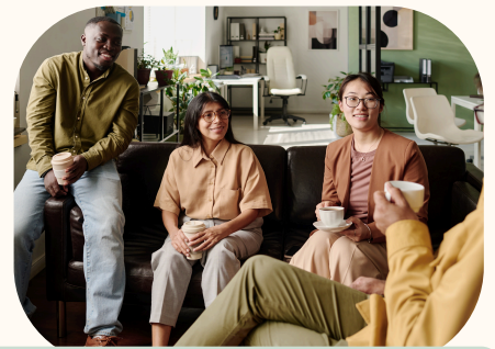
THE MEETING PLACE: NEURODIVERSE SPACE