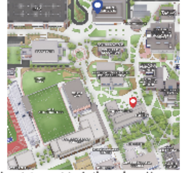
*Use stairs next to Anthropology Museum or elevator on first floor inside Arts Complex.