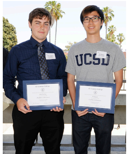
The Foundation supports programs aimed at student success. Beginning in high school, South Bay Promise students receive special instruction and counseling that eases the transition to college and keeps them on track to transfer to a four-year college.