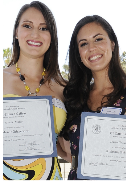
Students who can afford to enroll full-time are more likely to complete their degree in two years, saving significant time and money over their lifetimes. The Foundation distributes $1 million in scholarships annually allowing students to focus on their studies.