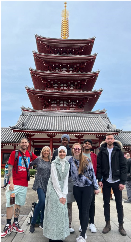
ECC Forensics Team visited Sensō-ji, Tokyo's oldest Buddhist temple in Asakusa, Japan.

El Camino's award-winning Forensics Team competed in the International Forensics Association's 33rd Annual Speech and Debate Tournament and Conference in Tokyo, Japan in March. The tournament was conducted in English and adhered to National and British Parliamentary formats.