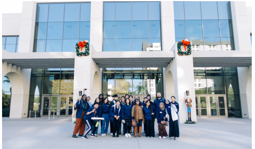
Advocacy Academy : 12/02/23