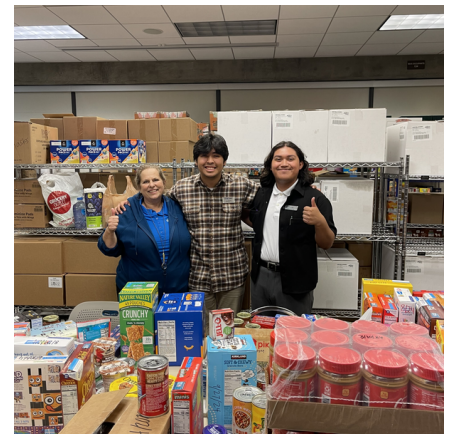
Warrior Pantry: 11/21/23