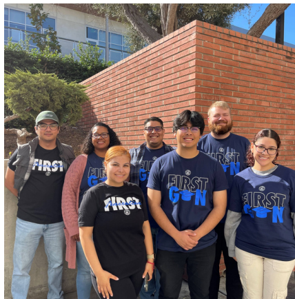
First Gen Day: 11/08/23