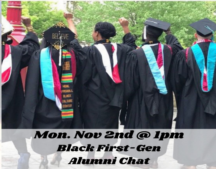
Mon. Nov 2nd @ 1pm Black First-Gen Alumni Chat