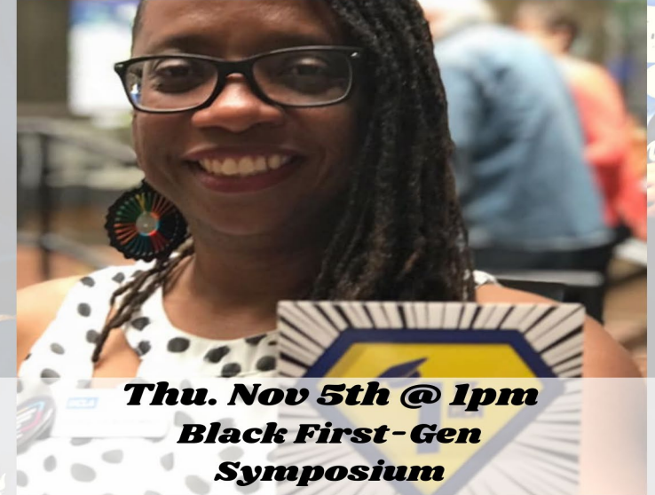
Thu. Nov 5th @ 1pm Black First-Gen Symposium