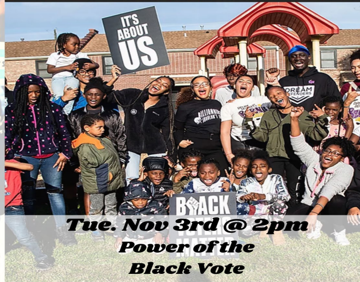
Tue. Nov 3rd @ 2pm Power of the Black Vote