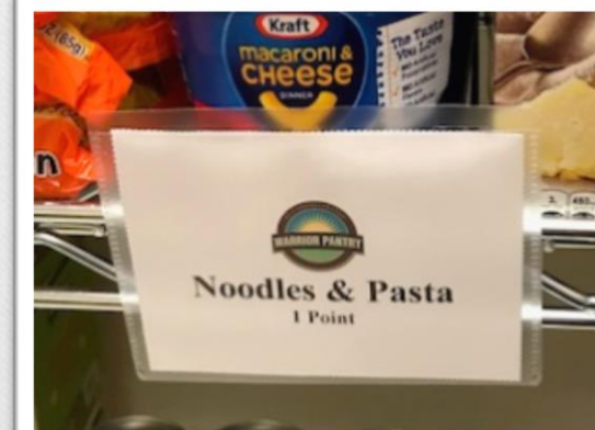
Warrior Pantry Ribbon Cutting: October 16 th , 2017